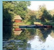
Citizen Park of Bremen